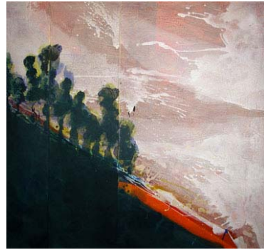
Larson's Ridge 40" X 42"

We're serving grits and grillades again, a New Orleans brunch favorite. We have new paintings by each of the artists we represent. And of course, there's the Angel Ornament for 2007.