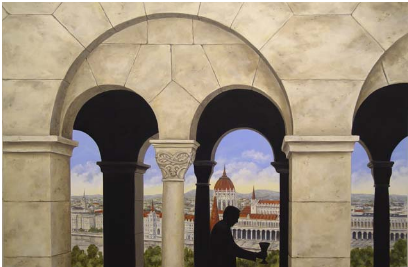
In Search of Heaven 48" X 72"