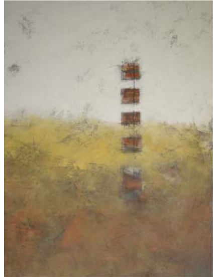
Vistas 24 48" X 36"