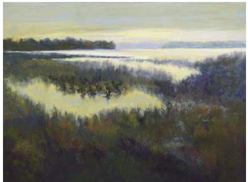
Canada 36" X 48"