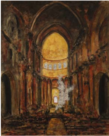
In Sense Watercolor Study