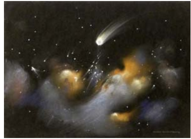
Stardust Series Pastel