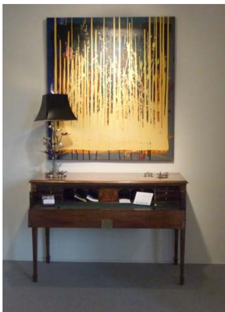
Henry Callahan's Cumberland Falls IV (54" X 48") with pewter Gumbo Lamp by Charles H. Reinike III.

There are new works on view by six of our gallery artists. Their works are full of surprises and new directions that have evolved in the past year.