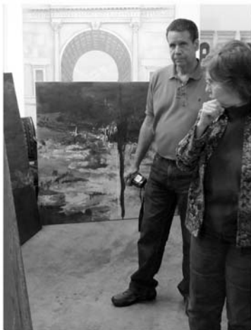
The Choir (32" X62") Peter J. O'Halloran's grouping of 8 paintings.

In the gallery you will see only original paintings and sculpture—no reproductions. These art works are the unique pieces that over the past months (and sometimes years) the artists have lovingly and carefully created. Their hands wielded the brushes that carried the paint onto the canvases that they prepared. When you visit the gallery you are seeing exactly what the artist created without the filter of printing or electronics.