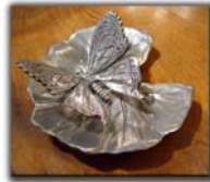
Pewter Lily Pad and Butterfly 5" X 5"